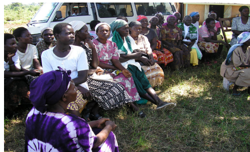
Women from the grassroots women’s group, GROOTS Kenya, participating in a Local Dialogue.

Through dialogues, grassroots women have demonstrated their capacity to organize around their own priorities and initiate dialogues with local authorities to improve their access and control over resources and services, as is evidenced by the experience of the UCO-BAC (See case study below). For grassroots women, engendering governance is more than electoral politics. It is about changing relations of power by identifying and implementing practical solutions for the everyday priorities of communities.